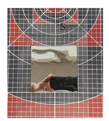
Figure 1. Provided sample.

The sample had dimensions of 100×100 mm and is pictured in Figure 1. As mentioned above, the sample had a titanium layer composition.